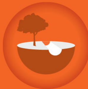
Drains / Rivers